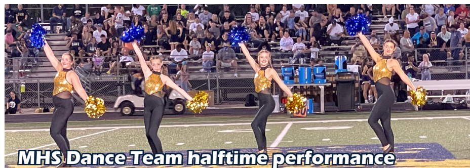
MHS Dance Team halftime performance