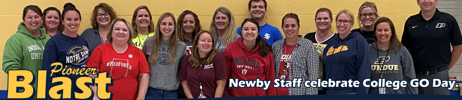
Newby Staff celebrate College GO Day.