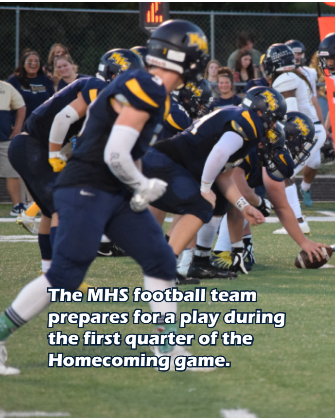
The MHS football team prepares for a play during the first quarter of the Homecoming game.