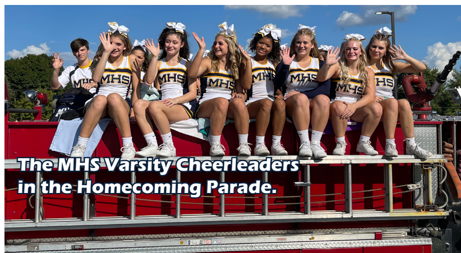
The MHS Varsity Cheerleaders in the Homecoming Parade.